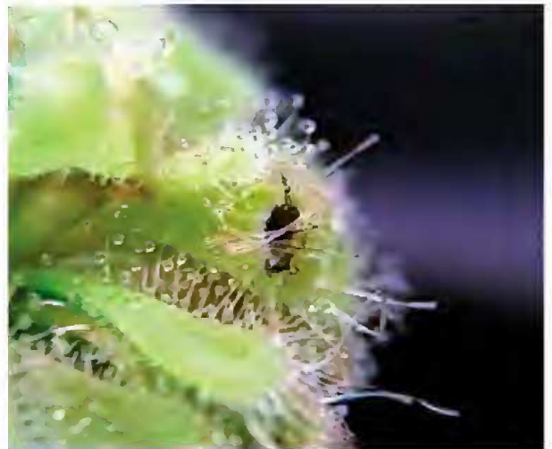
Figure 10: Several snap-tentacles acting like securing straps on Drosera burmannii .

In this respect, it is noteworthy that D. glanduligera and the smallest examined species of section Bryastrum were able to move two or even almost all catapults nearly synchronically at once (Fig. 9) like a gripping whole hand. When touching a tentacle more intensely, so that the small leaf totters just like touched by larger prey, several catapults are triggered almost at once (documented on our film “Catapults in Pygmyland”). This behavior is certainly effective to capture struggling prey that is too large for one snap-tentacle only. Simultaneously bending catapults can even be able to fix prey without any mucilage because they form first a circular kind of grid cage and act like securing straps after the described gradual narrowing (Fig. 10). If rapid enough, they even capture prey without any glue and push it onto the sessile digestion glands. That is an important advantage in areas with heavy rain, as well as for temporarily submerged plants. Water washes off the mucilage, so the sticky part of the trapping mechanism becomes obsolete. Only the independent rapid capture mechanism remains active to supply animal nutrition. Our study shows that apart from the sessile digestion glands on the lamina, each single repeatedly catapulting tentacle has all properties known